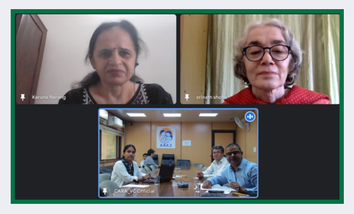
Refresher Training - Rajasthan