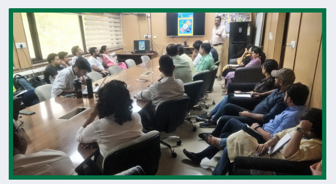
Refresher Training - Uttar Pradesh