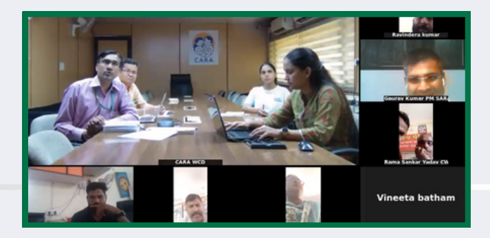
Refresher Training - Andhra Pradesh